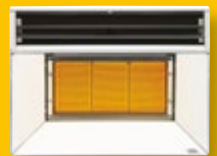
Available in Natural Gas & LPG

Input: 24MJ, 7.0kw Width: 505mm Height: 332mm Depth: 417mm Weight: 10kg