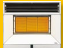
Available in Natural Gas

Input: 25MJ, 7.0 kW Width: 505mm Height: 359mm Depth: 419mm Weight: 10kg